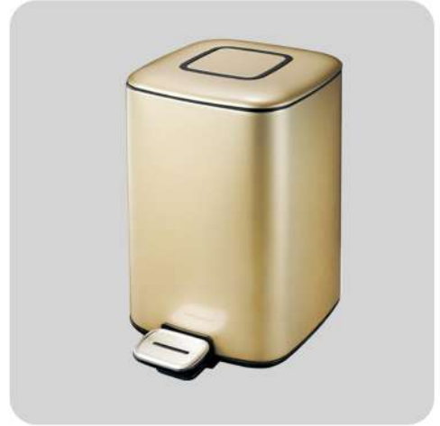
SIZE: 12L COLOR: GOLD