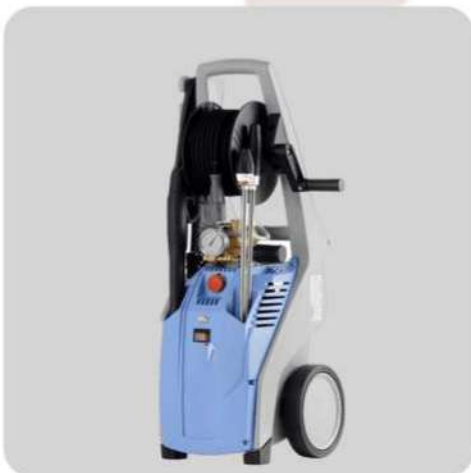
WASHER 37.5 X 36 X 90 CM