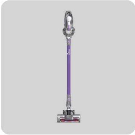
ARTAX VACCUME CLEANER