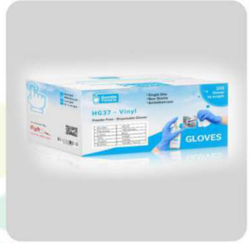
DISPOSABLE GLOVES BLUE VINYL