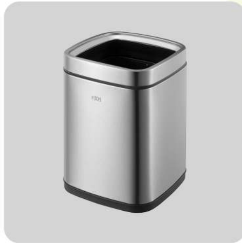
SIZE: 12L COLOR: SILVER