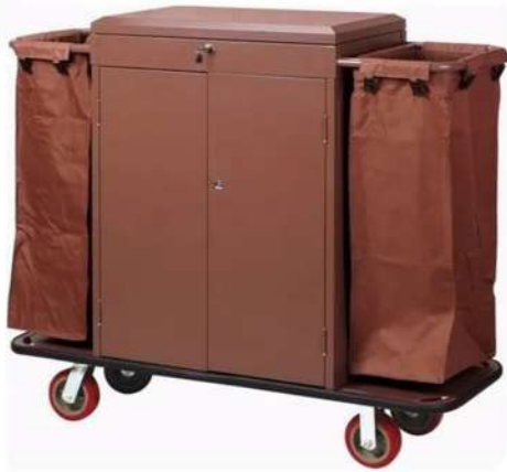
HOUSEKEEPING TROLLEY BAGS