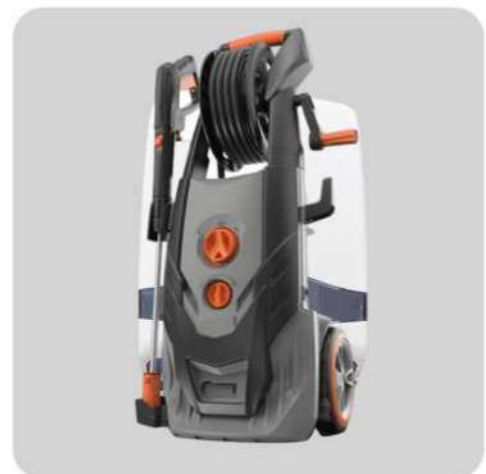
MOP BUCKET WITH SIDE PRESS WRINGER