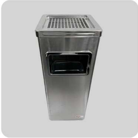
SIZE: 12L COLOR: SILVER