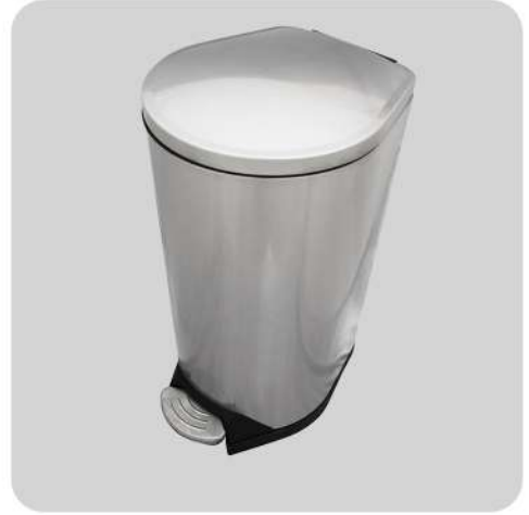
SIZE: 50L COLOR: WHITE