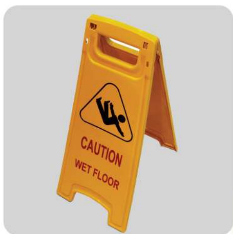
CAUTION WET FLOOR FLOOR SIGN