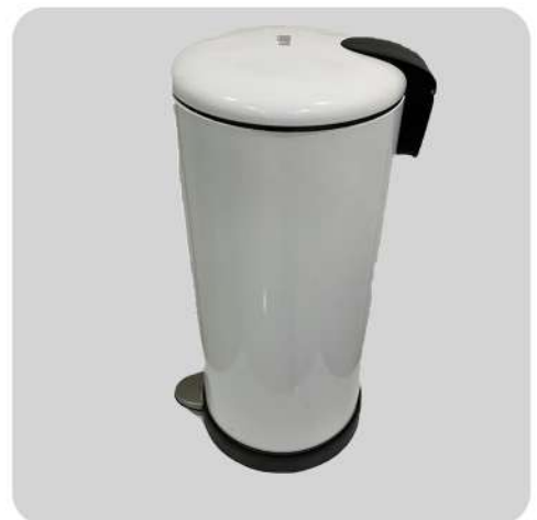
SIZE: 27L COLOR: WHITE