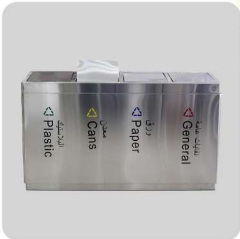
SIZE: 120L COLOR: SILVER