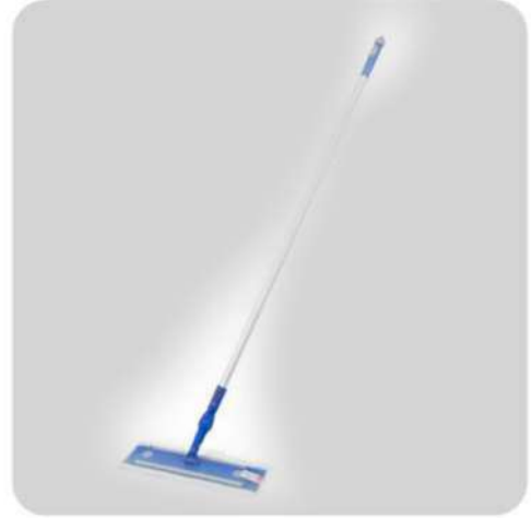
FLAT SPRAY MOP SPRAY MICROFIBER SET