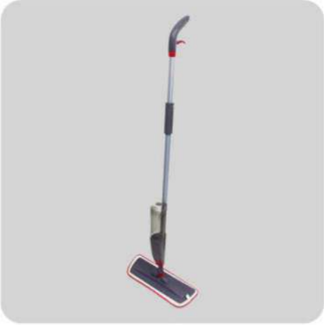
SPRAY MOP PLASTIC