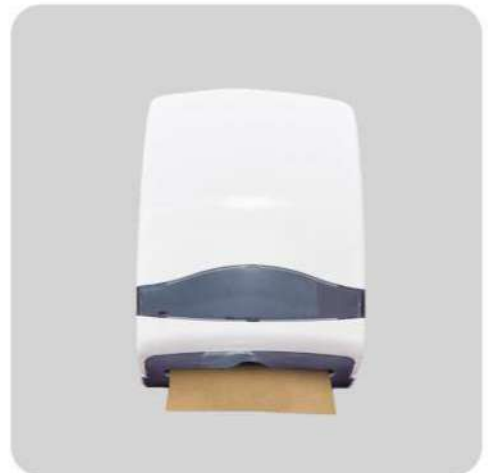
TISSUE PAPER DISPENSER 28 X 11.5 X 38.5 CM