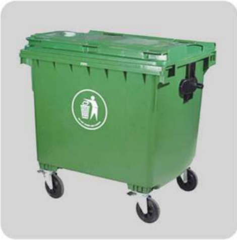
TRASH BIN 122 X 122 X 76 CM