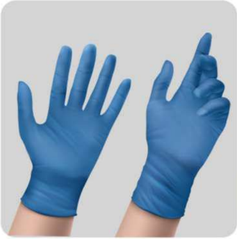
DISPOSABLE GLOVES BLUE VINYL