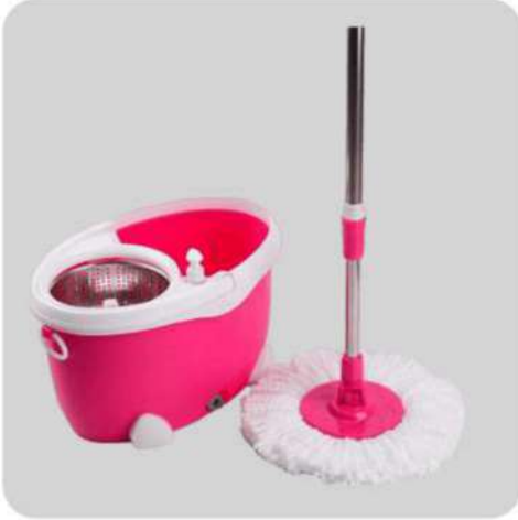
MOP 45 X 118 X 30 CM