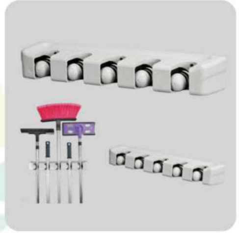
MOP BROOM HOLDER