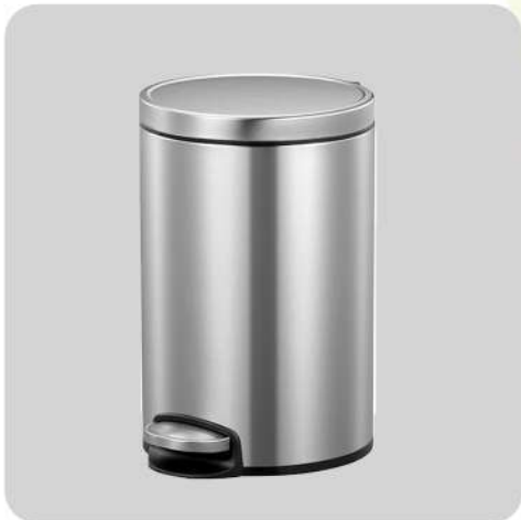
SIZE: 44CM COLOR: SILVER