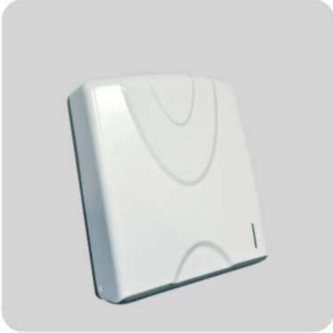
DISPENSER PEARL WHITE