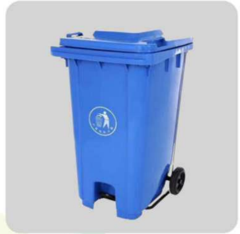
TRASH BIN 120 LTR