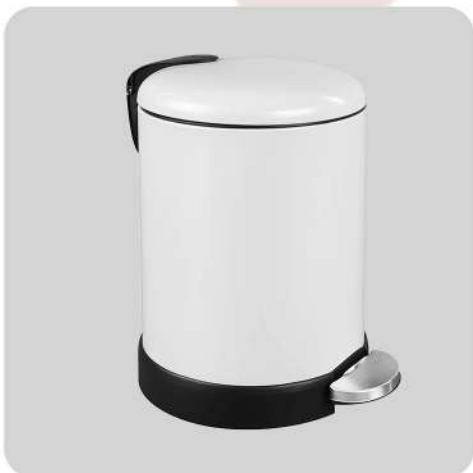
SIZE: 12L COLOR: WHITE