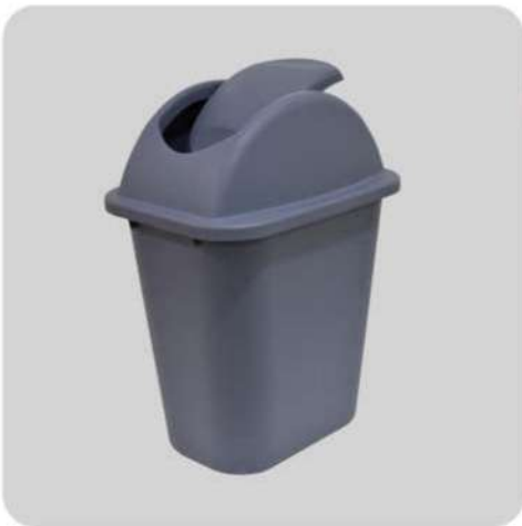
TRASH BIN WITH PEDAL 55 LTR