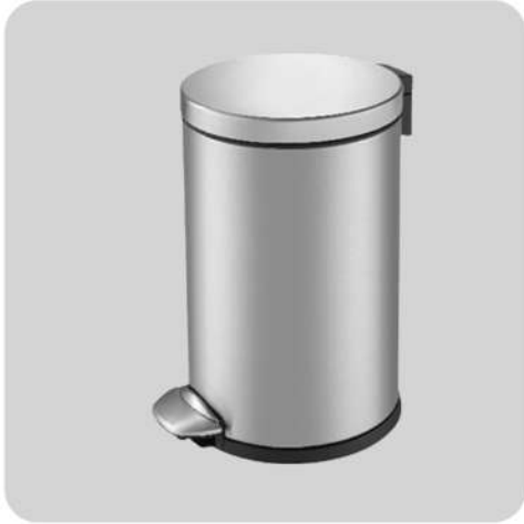
SIZE: 12L COLOR: SILVER