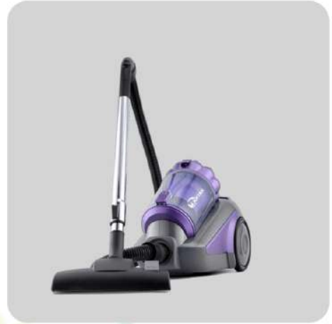
VACCUME CLEANER 2 LTR