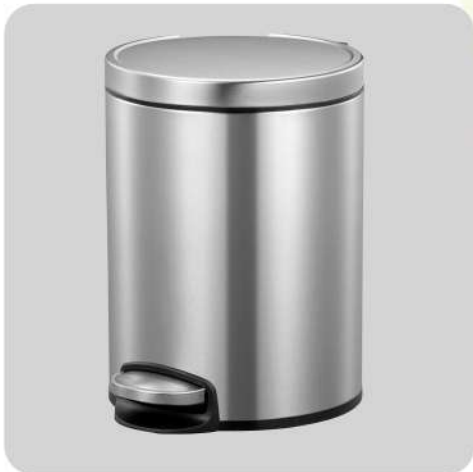
SIZE: 5L COLOR: SILVER