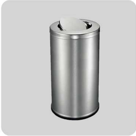
SIZE: 56L COLOR: SILVER