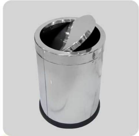
SIZE: 10L COLOR: SILVER