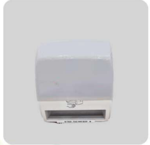
TISSUE DISPENSER 32 X 27 CM