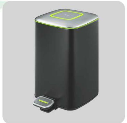
SIZE: 6L, 9L, 12L COLOR: SILVER