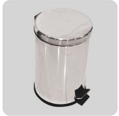
SIZE: 12L, 20L, 30L COLOR: SILVER