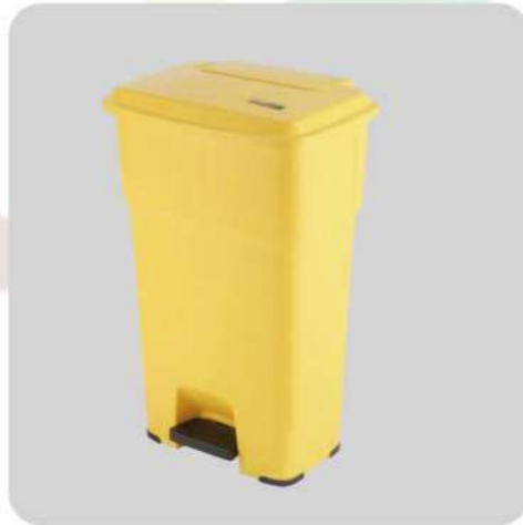
TRASH CAN WITH PEDAL 60 LTR