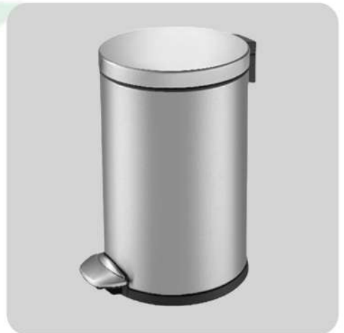
SIZE: 8L COLOR: SILVER