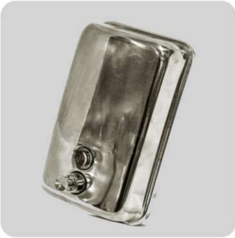
DISPENSER 1 LTR STAINLESS STEEL