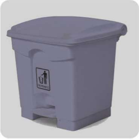
TRASH CAN WITH PEDAL 30 LTR