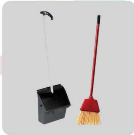
FILMOP BROOM DUSTPAN PLASTIC