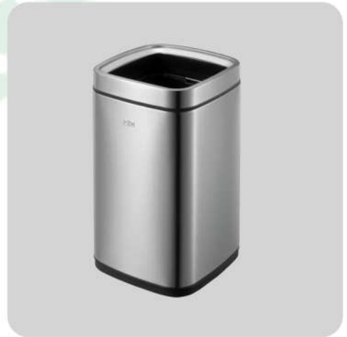
SIZE: 21L COLOR: SILVER