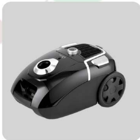
VACCUME CLEANER 4 LTR