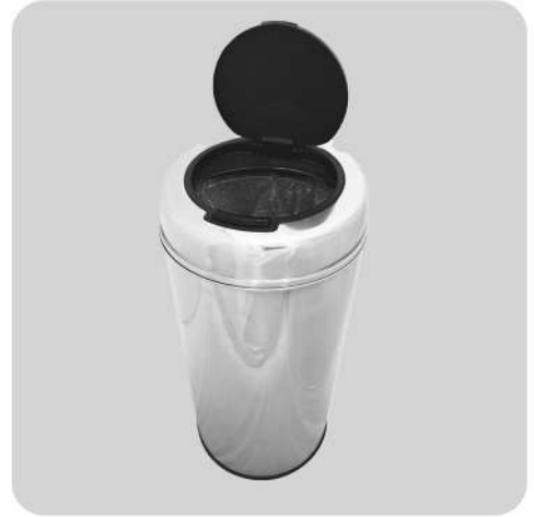
SIZE: 50L COLOR: SILVER