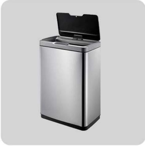
SIZE: 80L COLOR: SILVER