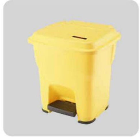
TRASH CAN WITH PEDAL 35 LTR