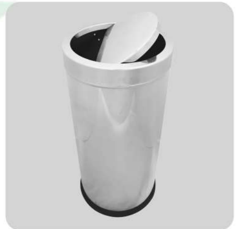
SIZE: 20L COLOR: SILVER