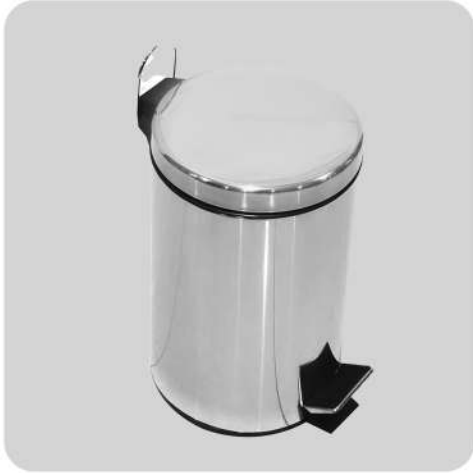
SIZE: 7L COLOR: SILVER