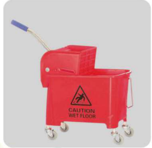
MOP BUCKET WITH WHEEL 20 LTR