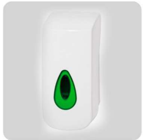
SOAP DISPENSER 1 LTR WHITE