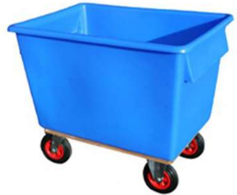
LINEN TROLLEY (PLASTIC)