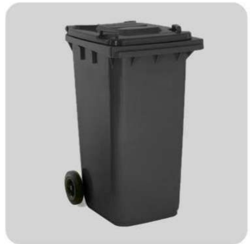
TRASH BIN WITH PEDAL 240 LTR