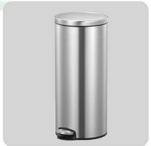
SIZE: 64CM COLOR: SILVER