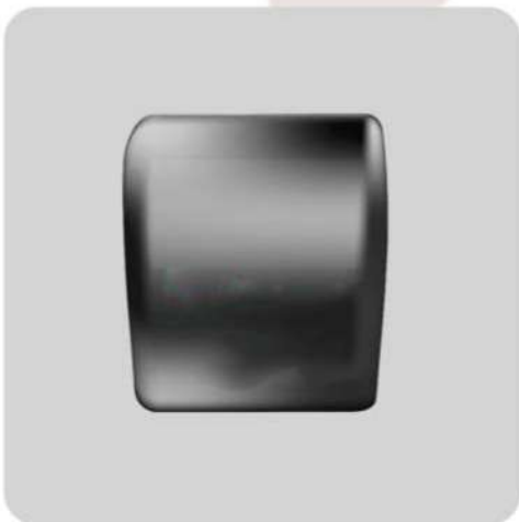
TISSUE PAPER DISPENSER 32 X 22 X 36 CM