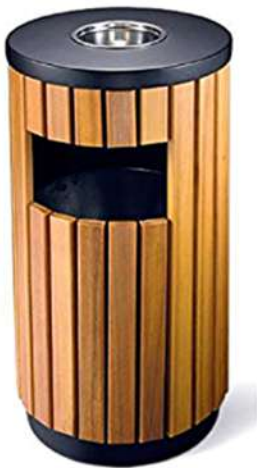
GROUND ASH BARREL