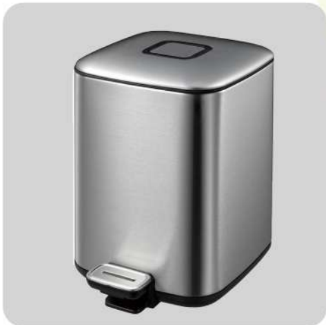
SIZE: 6L COLOR: SILVER