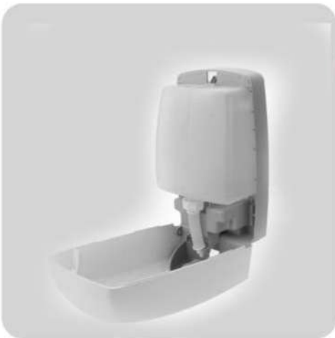
DOUBLE CLASS SOAP DISPENSER