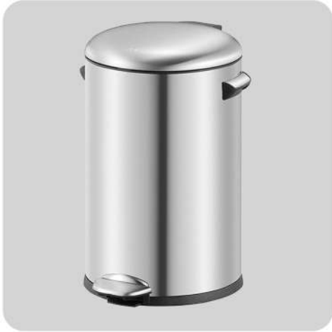
SIZE: 5L, 8L, 12L, 20L, 30L COLOR: SILVER