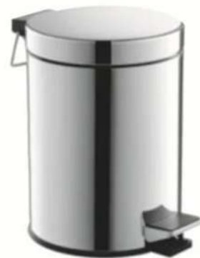
PEDAL BIN- 3L