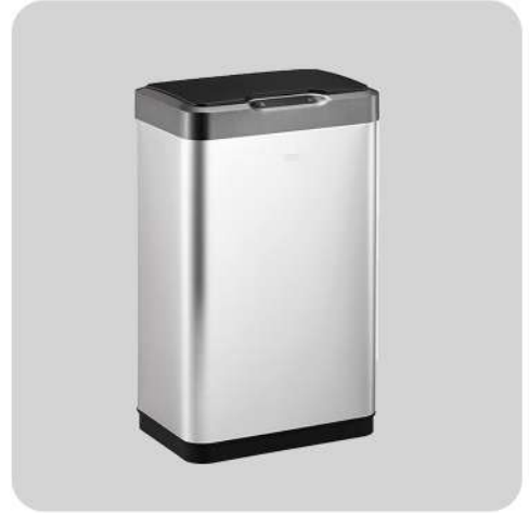
SIZE: 30L COLOR: SILVER