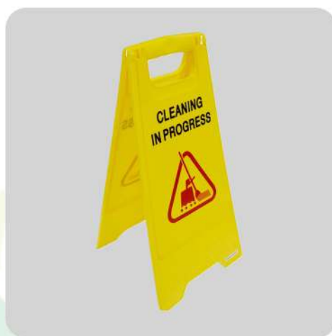
CLEANING IN PROGRESS FLOOR SIGN